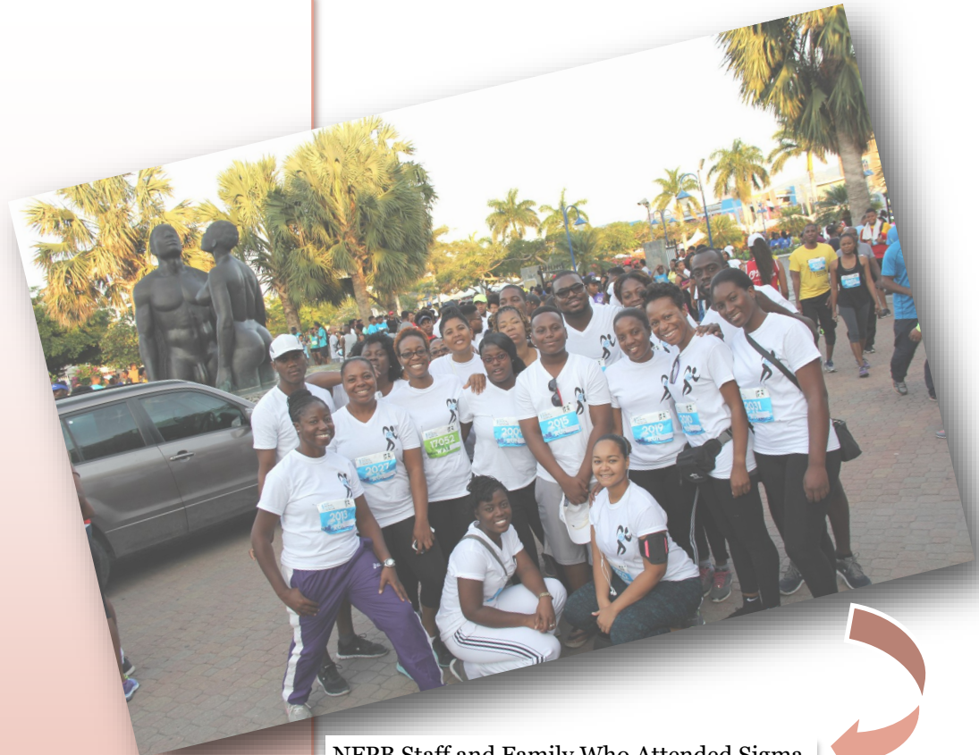
NFPB Staff and Family Who Attended Sigma Run 2017