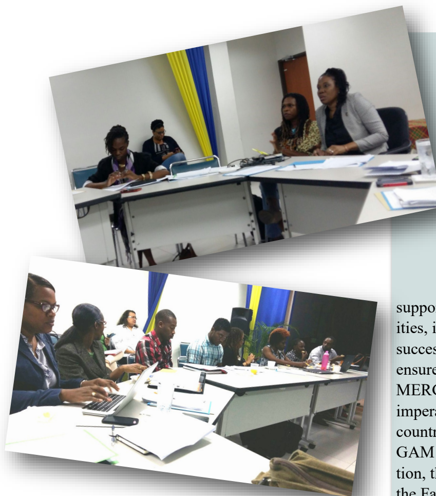
Members of the M.E.R Unit at NCPI Validation Meeting, PIOJ

In ensuring the successful completion of the GAM, and the National Commitment and Policy Instrument (NCPI) Report, the MER Director, in collaboration with the Joint United Nations Programme on HIV/AIDS (UNAIDS) and Ministry of Health (MoH), established the GAM Steering Committee, and the NCPI Sub-Committee; advocated for funding for a GAM consultant (this was successful – PAHO/WHO provided full support); advocated for funding for GAM activities, including validation meetings (this was successful – UNAIDS provided full support); ensured validation of the Reports at the J-MERG level before official submission. It is imperative to note that Jamaica is required, as a country, to report national data through the GAM process to inform the Political Declaration, the Prevention Gap Report, and the Get on the Fast-Track Life cycle approach to HIV, in order to inform sound strategic programming.