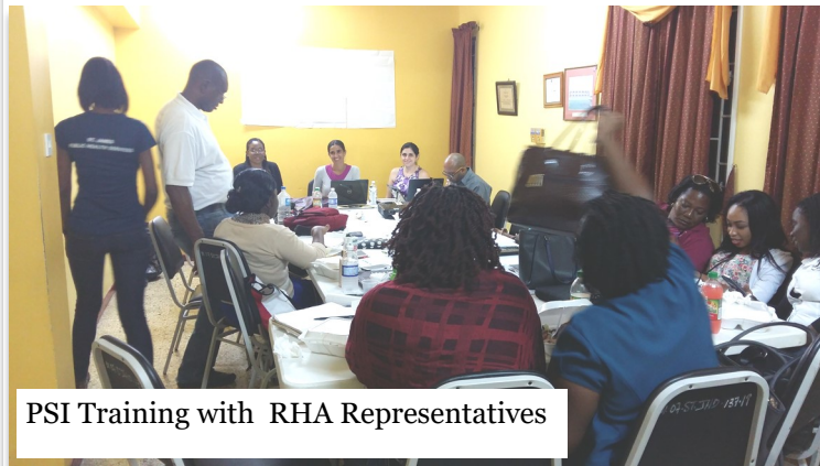
PSI Training with RHA Representatives