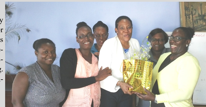
The M.E.R Unit Director accepting gift from the Administrative Team at Princess Margaret Hospital

The Director of MER was specially invited by the Medical Officer of Health and the Director of Human Resource Management of Princess Margaret Hospital, St. Thomas, to provide specialized training to all its administrative professionals in the Art of Minute and Note-Taking. Subsequent follow-up reported significant improvement.