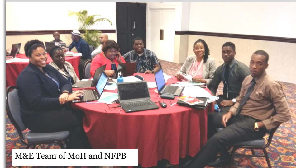
M&E Team of MoH and NFPB

The MER senior team was specially invited by the UNAIDS to a Caribbean-wide Spectrum Training. With Spectrum software, countries are better able to plan, make projections and evidence-informed decisions in